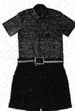
Diagram 2. Boys I-VIII