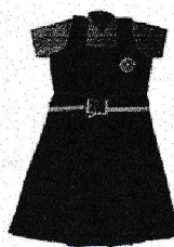
Diagram 3. Girls VI-VIII