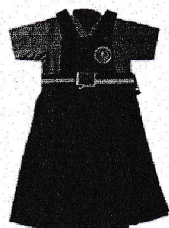
Diagram 1. Girls I-V